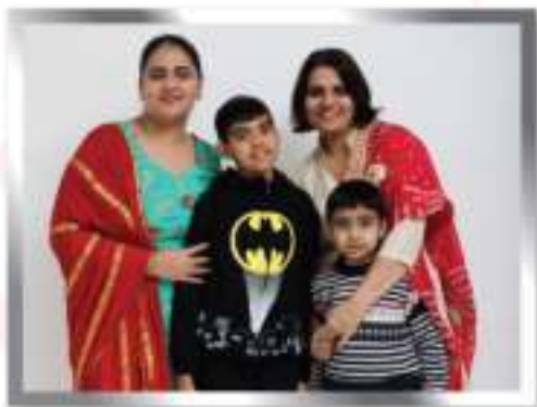
The Uppal Family