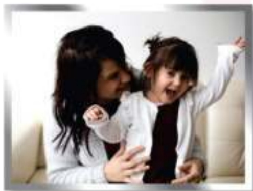
The Durance Family