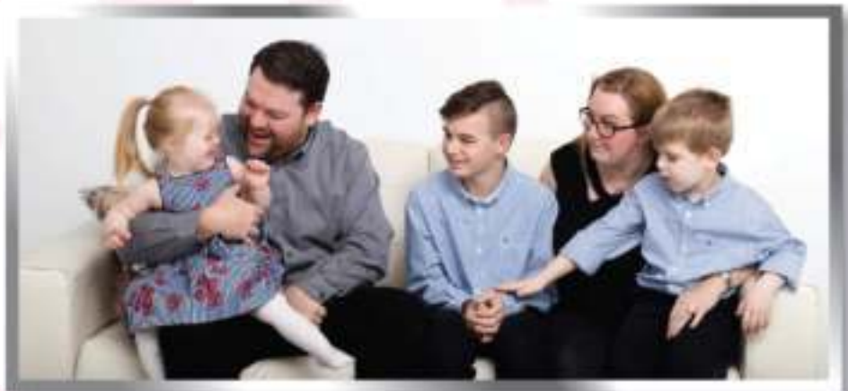
The Watts Family