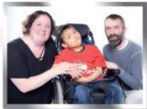
The Hall Family