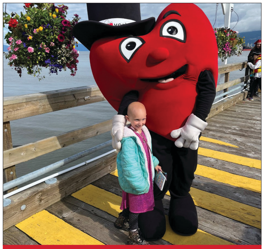
Your generosity funds life-changing support for kids across BC

Variety's core grant areas range from adaptive & mobility equipment to specialized therapies, educational support and mental wellness counselling in addition to private autism assessments and private psychoeducational assessments.