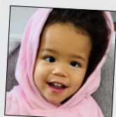
Prescott, 2 Okanagan