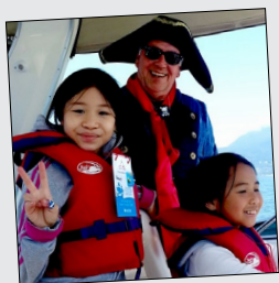
Attending Variety's Boat for Hope (2016)