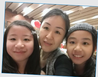
Attending the first Variety Christmas Party (2013)